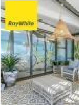
Ray White Hervey Bay 0741285000