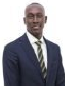
Alor Alor 0479091054