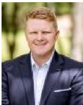
Alexander Garden 0407245287