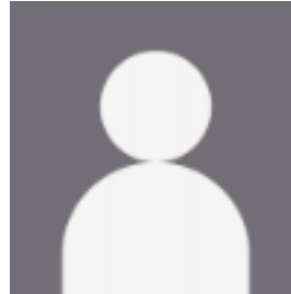
Prestige Property Group Property Management 0295977372