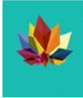
Vantage Luxe Homes 1300826824