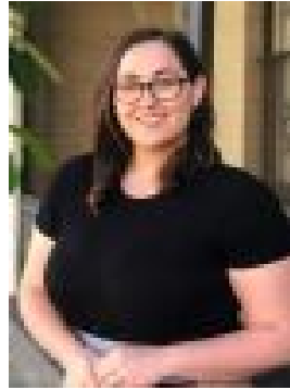
Marina Gear 0416090414