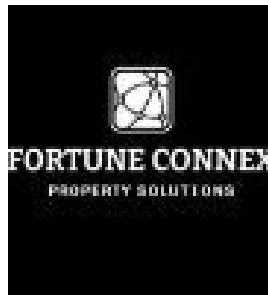
Rental Fortune Connex 0287190843