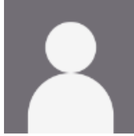
Prestige Property Group Property Management 0295977372