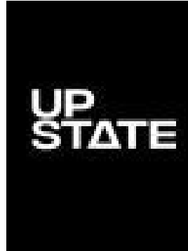
Leasing Team 0484005351