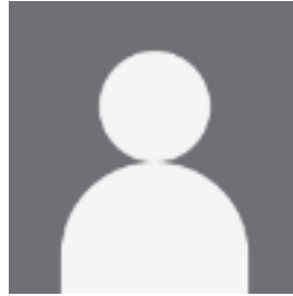
Leasing Archer 02 6262 5232