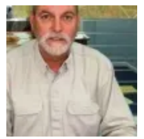
Peter Calliss Calliss

Bedrooms: 3 Bathrooms: 1 Parkings: 5 Area: 1100 m2 Type: House