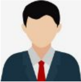
LJ Hooker Bacchus Marsh