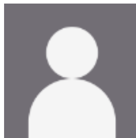
Leasing Officer 07 3371 3933