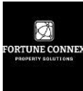
Rental Fortune Connex 0287190843