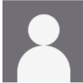
Baileux Admin 0748294816