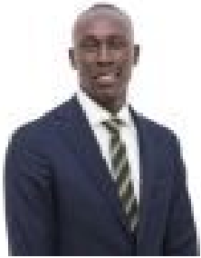
Alor Alor 0479091054