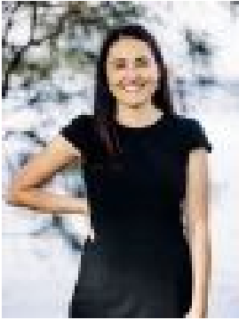
Property Management Lake Macquarie 0249596577