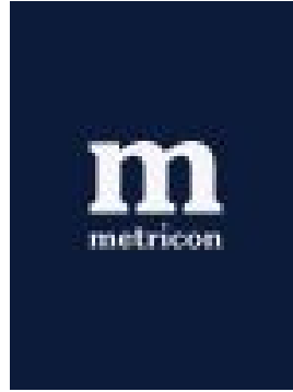
Contact Metricon 1300786773