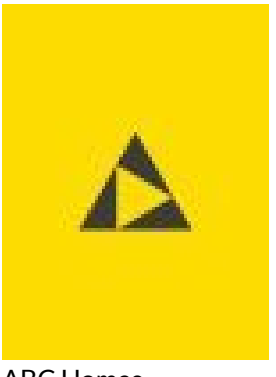
ABC Homes 131828