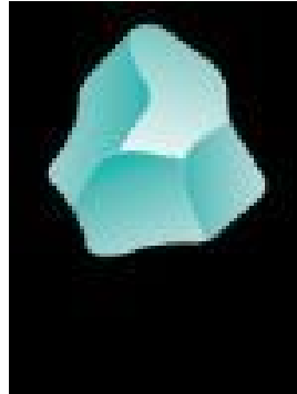
Obsidian Projects 0298886800