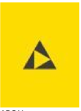
ABC Homes 131828