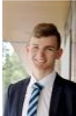
Fin JTS Realty 0265415331