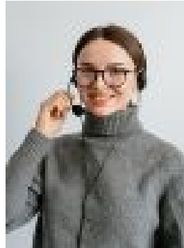
ABC Homes 131828