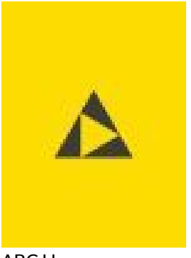
ABC Homes 131828