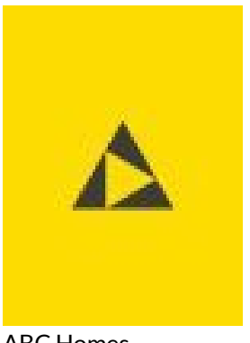
ABC Homes 131828