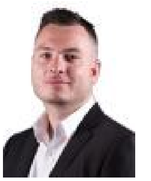
Menangle Park Sales Team