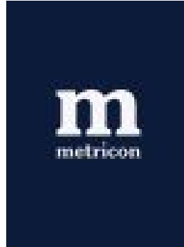
Contact Metricon 1300786773