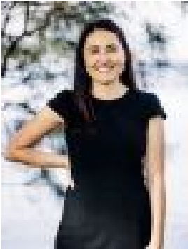
Property Management Lake Macquarie 0249596577