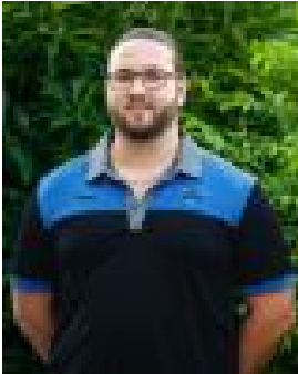
Michael Crichton 0754487700