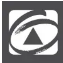
First National Clayton 0399757888